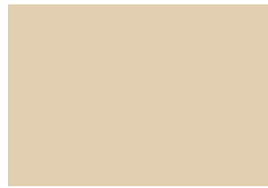
Off White 6015