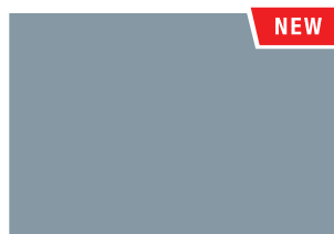
Miner Grey 6242