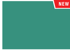
Petronas Green 6580