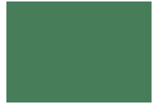
Apple Green 6638