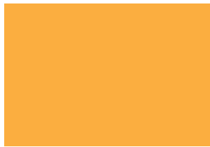
Sunrise Yellow 6669