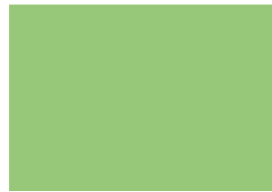
Kiwi Parrot 6668